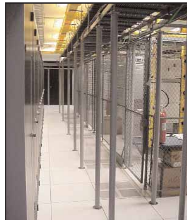
Baltimore Colocation Area