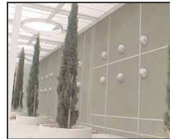
Oakland Colocation Area