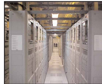
McLean Colocation Area