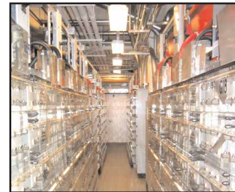
Battery Power in the New York 2 Colocation Area

* Carrier available through a Cross Connect to New York 1