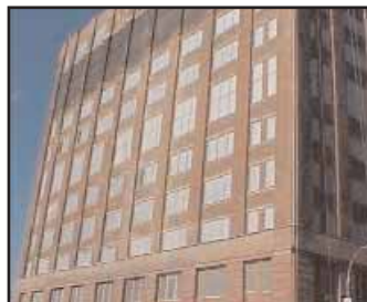
New York 2 Gateway

The New York 2 Gateway (85 10th Avenue) provides premium space built with connectivity to Level 3's premier network and the networks of numerous carriers.