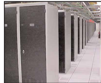
Newark Colocation Area

The Newark Gateway provides easy access to Level 3's premier broadband network.