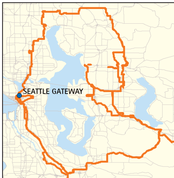
Seattle Gateway: 1000 Denny Way, Seattle, WA 98109 (4th Floor)