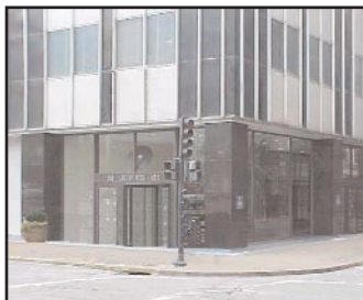
St. Louis Gateway