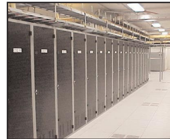
St. Louis Colocation Area